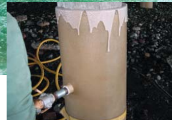
SeaShield 550 Epoxy Grout being pumped into the SeaShield Series 500 Fiber-Form Jacket.