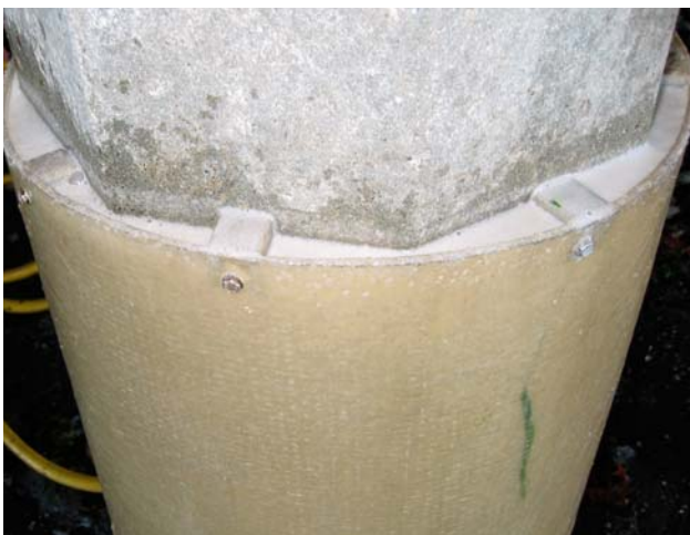
SeaShield 550 Epoxy grout pumped into the annulus around an existing octagonal concrete pile.

For further details please refer to the technical data sheets for the SeaShield Fiber-Form Jacket and SeaShield 550 Epoxy Grout.