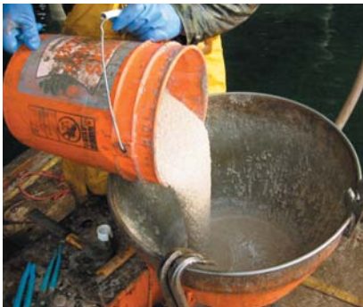
SeaShield 550 Epoxy grout being mixed and poured into pump.

The SeaShield 550 Epoxy Grout is a 3-component water displacing epoxy resin/aggregate formulation which provides a durable, well bonded repair to concrete, steel and timber piles below water. The 550 Epoxy Grout can be easily pumped into the Fiber-Form Jacket due to its excellent flowability characteristics.