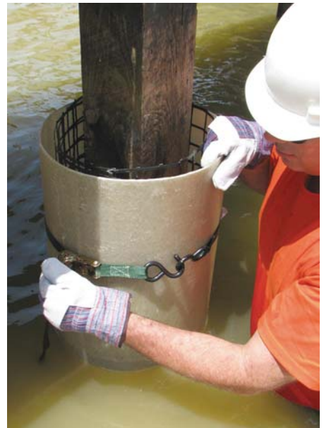
Grout can be pumped as soon as the SeaShield Fiber-Form jacket is secured in place.