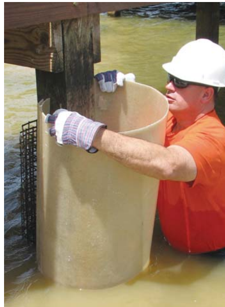
The SeaShield Fiber-Form jacket is then snapped in place around the C-GRID® 450.