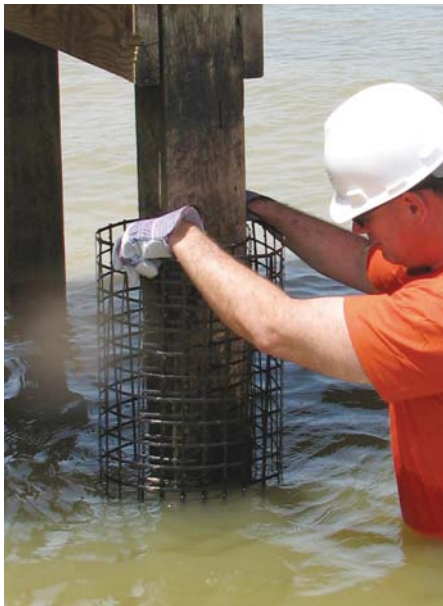
The lightweight and non-corrosive C-GRID® 450 is installed around the pile.