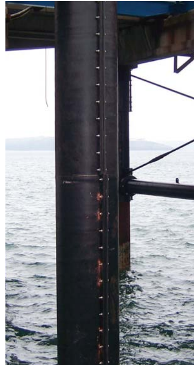
The SeaShield Series 2000FD System features a controlled application tensioning system.