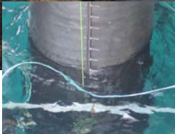
SeaShield Series 2000FD System designed to withstand the most aggressive environments.