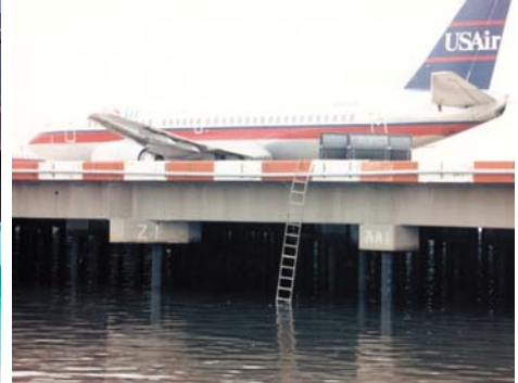
LaGuardia Airport used the SeaShield Series 100 System to provide corrosion protection for over 2,000 steel piles.