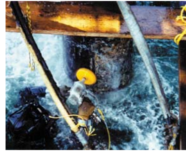
▲ The components of the Series 100 System can be applied under water with minimal surface preparation. ▼

SeaShield Outercovers are made of proven HPDE which is UV resistant, durable and tough. The outercovers provide mechanical protection against the elements and accidental impact. All Series 100 outercovers are custom manufactured to the diameter and length required to protect the pile. They are secured with Smart Band strapping and buckles.