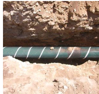
Premier Rock Shield SD in action, protecting the pipe coating.