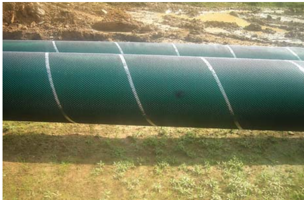
Premier Rock Shield SD can be easily applied and provides additional protection.