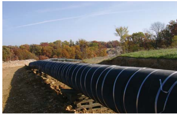
Premier Rock Shield HD is essential where pipelines are constructed through rocky terrain.