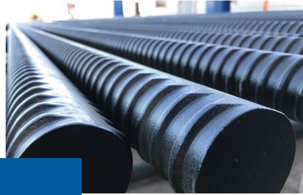
Tie rods coated with Protal 600 CTE Low VOC. Only 0.4 lbs/gal (50 g/l) VOC.