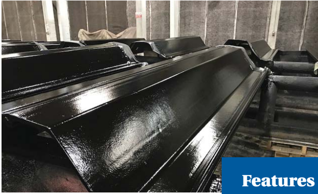
Protal 600 CTE provides long-term corrosion protection to steel sheet piles.