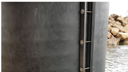
Seashield Serie 2000HD system already applied.