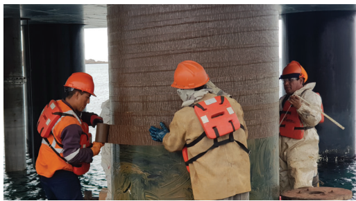
Contractors application of Premtape Marine Tape.